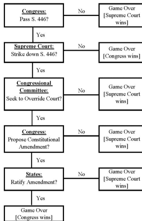
Figure 1: Congress vs. Supreme Court—Full Decision Tree

As shown in the decision tree in Figure 1, Congress has the ability to override a Supreme Court decision, 134 and it is also worth noting that Congress has used its power to do so on many occasions. 135 If the Court were to overturn Senate Bill 446, it would effectively deem the goal of the legislation unconstitutional and therefore a mere statutory adjustment would not trump the Court's decision. So for the purposes of this debate, it appears that a constitutional amendment is Congress's only recourse. However, overriding a decision is not an easy task, especially through a constitutional amendment. Further, the only situations in the decision tree in which Senate Bill 446 would pass and withstand a legal challenge are where either: (1) the Supreme Court cooperates (submits to the will of Congress); or (2) a congressional committee, Congress as a whole, and the states all work against the Court. While the decision tree provides a useful diagram of the possible outcomes, it does not give the full picture by itself because each player's strategy will vary depending on their individual preferences and the likelihood their actions will impact the outcome of the game.