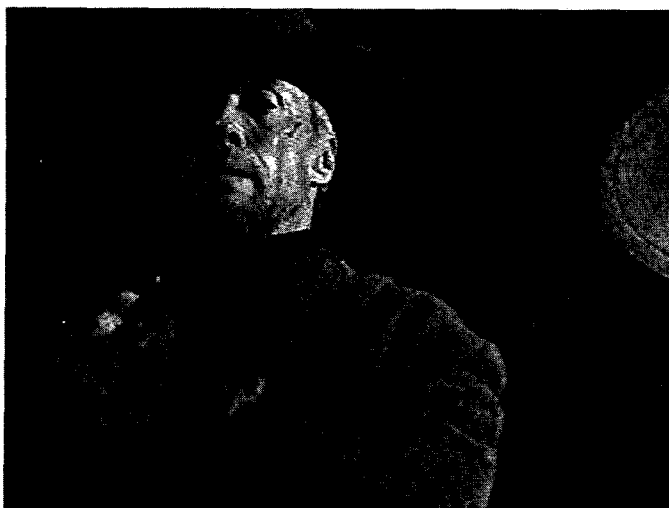
William Munny About to Shoot Little Bill

Memory fuels Alice's desire for vengeance and the Schofield Kid and Beauchamp's glorification of violence. But for Munny, memory disciplines the vengeful urge, even as it haunts and torments those who would be its agents. 83 His constant awareness and remembrance of the horror of death stands between him and enthusiasm for vengeance. His memories connect him to voiceless, decaying bodies. Those memories overtake him; they haunt him. They ensure that Munny is constantly aware of the fragility of life and the fact that little separates him from the unglorious prospect of death. The past "presses him [Munny] down and bows his shoulders; he travels with a dark invisible burden." 84