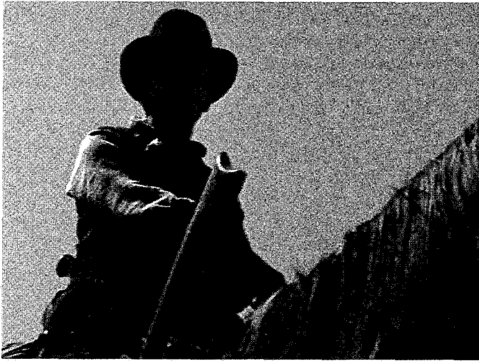
The Schofield Kid

When he first encounters Munny, the latter is struggling in the pig pen on his farm. Witnessing this scene, the Kid says: