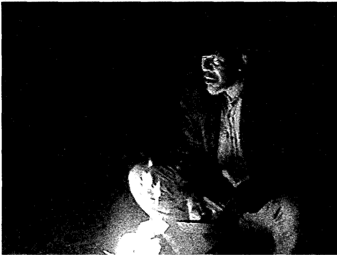
Ned Listening to William Munny

The third vision of death is less a remembering than a premonition brought on by a high fever that Munny experiences after having been beaten within an inch of his life by Little Bill. "I've seen death," Munny announces. "I've seen the angel of death. He's got snakes for eyes. . . . I saw Claudia too, all covered with worms. I'm scared I'm dying." 99 His remembrance of the dead is joined to his remembrance of death, producing a powerful fear that shapes Munny's response to the calls of a vengeful violence.