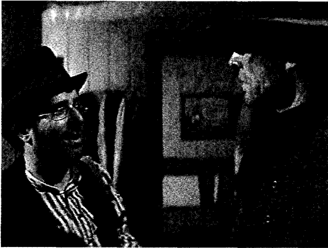
Beauchamp and William Munny

than-life agency. "I've always been lucky when it comes to killing folks." 108