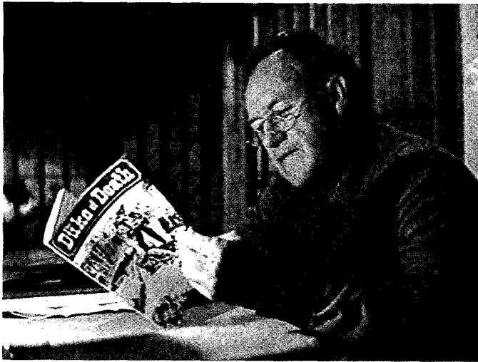
Little Bill Reading the "Duke of Death"

When Bill announces that he was, in fact, an eyewitness, Beauchamp's pretense to accuracy quickly fades. He corrupts all by glorifying and romanticizing violence, turning it into "fiction, to pretense, and to collusion between the media and the subjects of its attention." 70